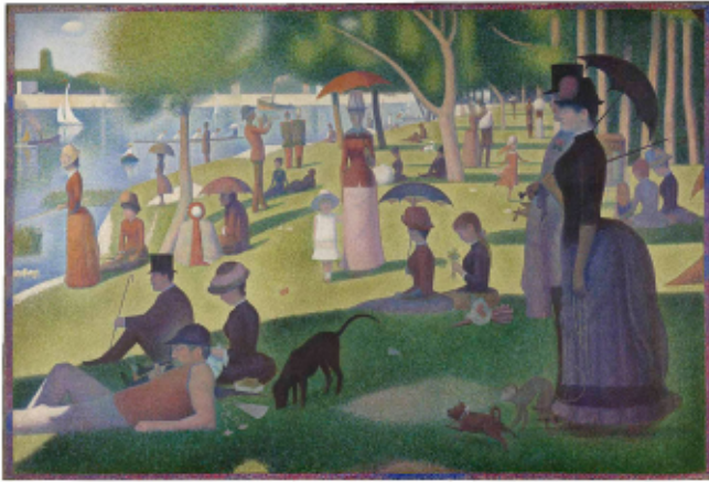
Georges Seurat, A Sunday Afternoon on the Island of La Grande Jatte – 1884